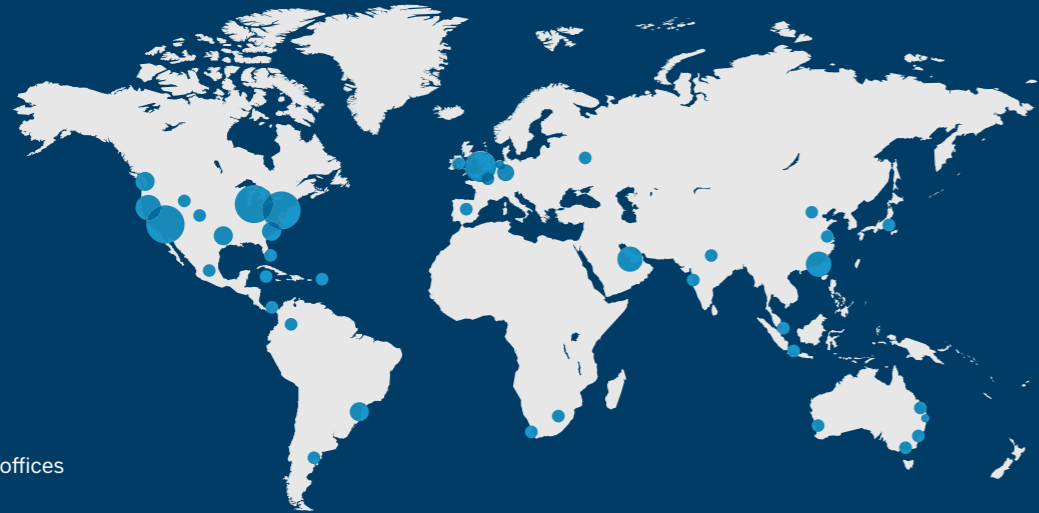
● FTI Consulting offices

Advisor to the world's top 10 bank holding companies